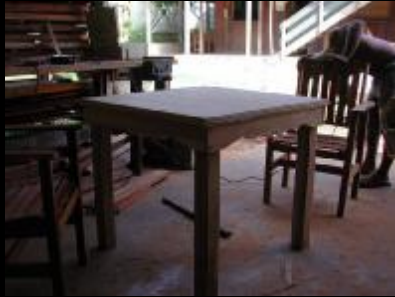
Finishing off some wood-work