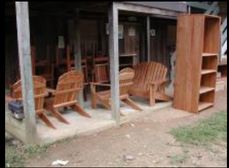
A showroom of much of the finished woodwork