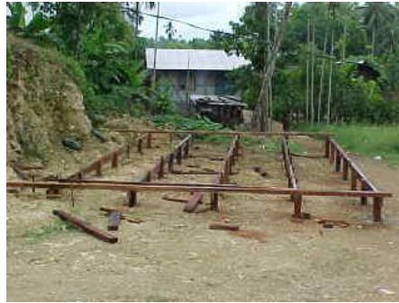
...and at the end of week one.

frames. This week we had a couple of days off from the building so as we could work on some orders for furniture so as to keep our customers happy as well as keep the show on the road.