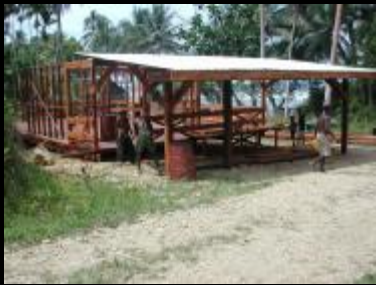
A visible miracle! The hostel in progress...