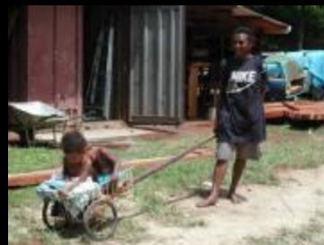
An interesting mode of travel ...!