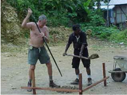
The beginning of the first day of construction of the new Senta hostel.

been repacked and was all ready to go. This is indeed good news for us at the