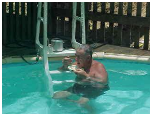
A good place to have lunch after a hard, hot day of construction work!