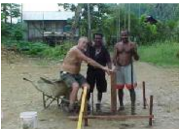
At the end of the day....

It is quite some time since I have been involved with a building project and any real physical work, needless to say after the first couple of days, I did not think I was going to make it. The weather seemed unbelievably hot. It was so hot that every couple of hours I would have to go and jump into the pool to cool off. I even had my lunch sitting in the pool. The foundations had to be dug through rock, my hands blistered, I was sun burnt and tired but with the help of 2 or 3 of the volunteers, we persevered and got the hard part finished. Now it is just a matter of making frames and standing them up. We put up a lean too which will act as a carport when the building is finished but now it is a nice shady place to prepare all the